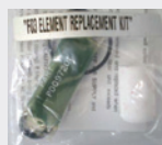
F00E900361 Filter Kit