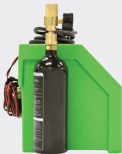
F00E900355 Inert Gas Pack