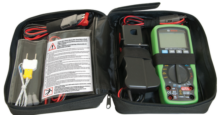
MMD 540H CAT III Multimeter Kit