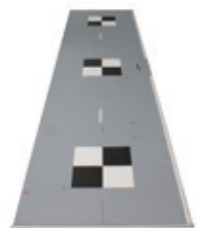
Floor Mat target