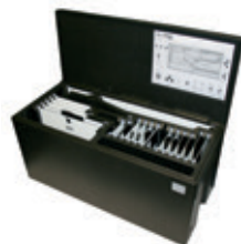
DAS 3000 targets with integrated storage box