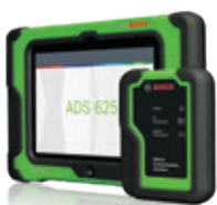
ADS 625 with ADAS Calibration Software Package