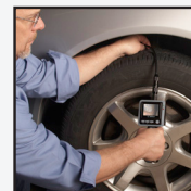
3ft. flexible camera tube