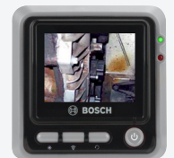
2.4" color LCD screen